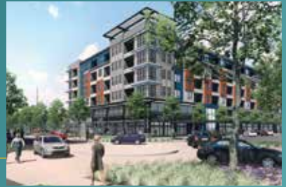
Renderings provided by Park Grove Realty