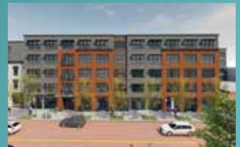
Renderings provided by Arnot Realty